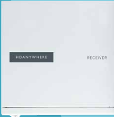
DISPLAY RECEIVERS X4