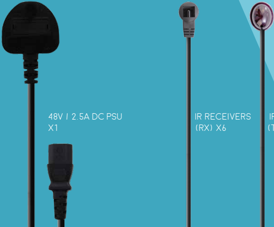
48V | 2.5A DC PSU X1

These connect to your mHub and send IR commands to your source devices. An additional 5th IR transmitter can be used for the "AVR" port and will carry out global IR functions at your mhub location.